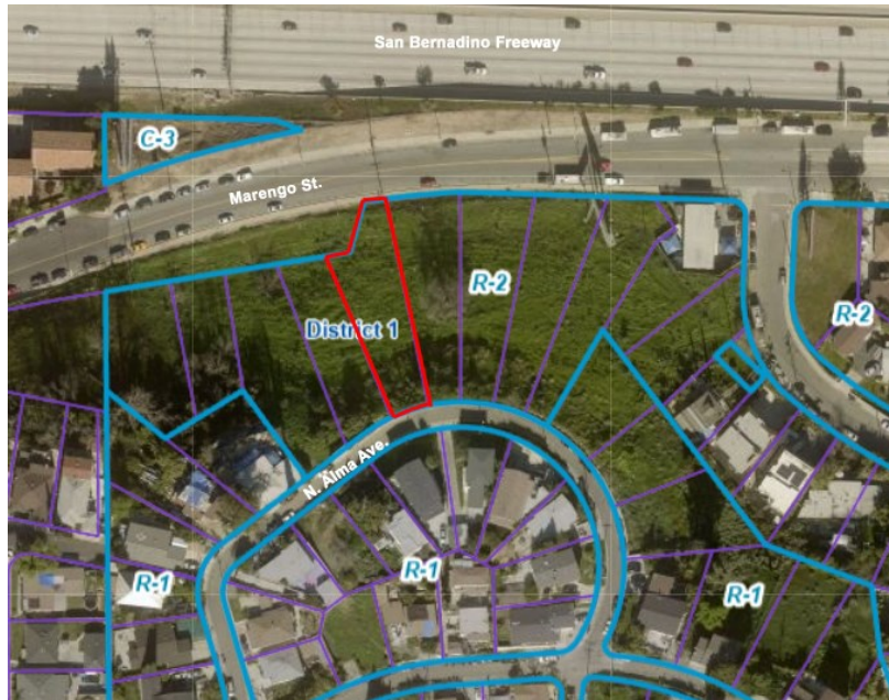
Aerial GIS Map